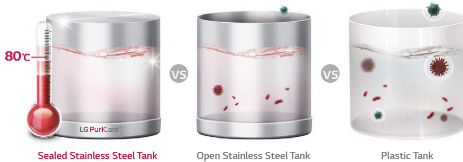
Sealed Stainless Steel Tank

Hot water is filtered and stored in sealed stainless steel tank to eliminate air-borne contamination.