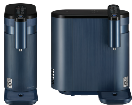
WD516AN.ANVRLML (Navy Blue)

• Refer to product manual on note of hot water